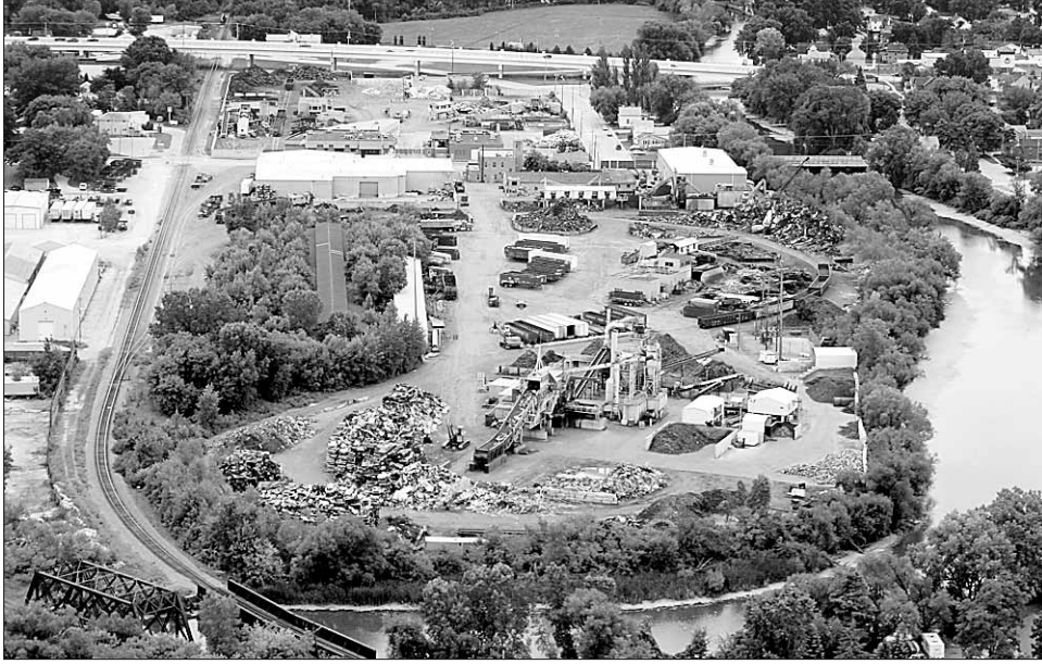
An aerial view shows the Sadoff & Rudoy Industries, LLP (SRI) properly in Fond du Lac. The Johnson Street bridge, which spans the Fond du Lac River and nearby railroad tracks, is at the top of the photo in this view looking south. Sadoff & Rudoy consists of six scrap metal recycling divisions located in Northeast Wisconsin, as well as one branch in Lincoln, NE. It employs over 230 individuals, 130 of which work in Fond du Lac.

If you are interested in finding out how SRI can benefit your organization or to find out more about SRI's environmental policy, please visit the Web at www.sadoff.com or call the office at 921-2070, where a professional staff is willing to assist your needs.