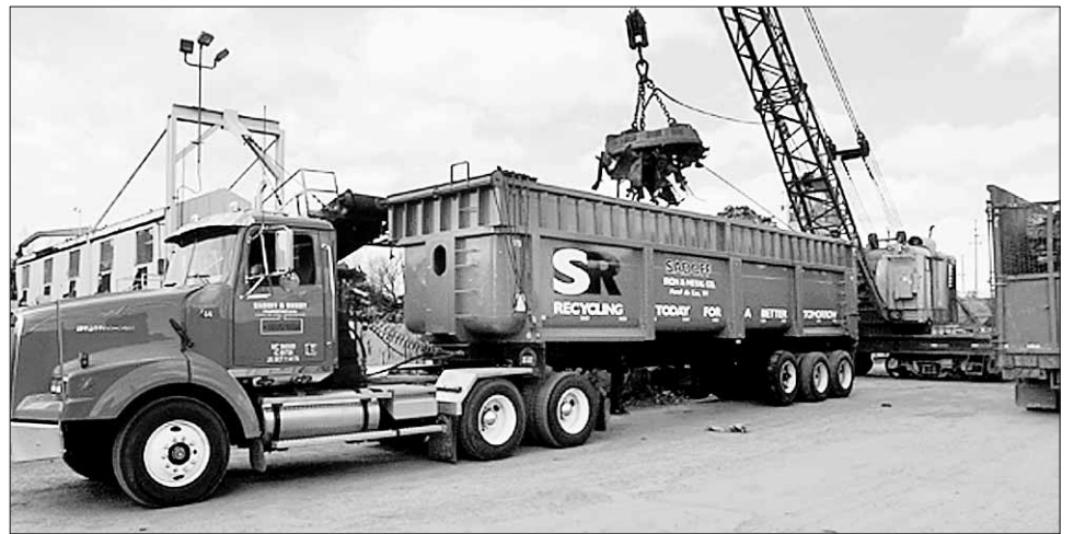
Sadoff & Rudoy Industries, LLP purchases scrap metal from manufacturers, as well as dealers from around the country supplying foundries, steel mills and metal smelters with the raw materials they need to create finished products.

“SUCCESS THROUGH PEOPLE, CUSTOMERS AND OPERATIONAL EXCELLENCE”